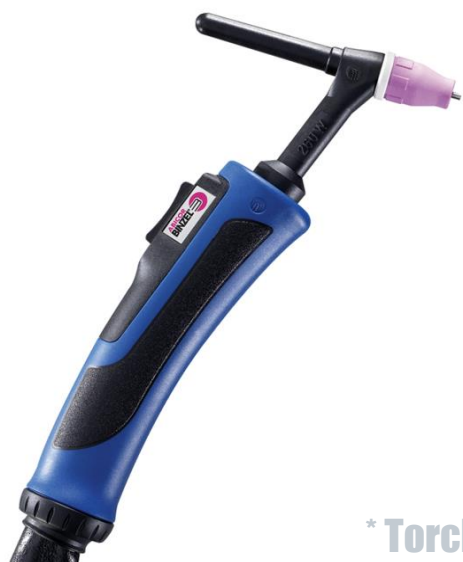
* Torch type